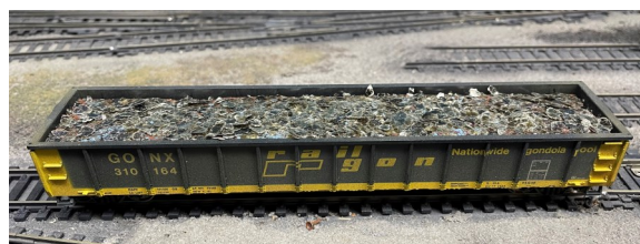
Bob Weinheimer's scrap load